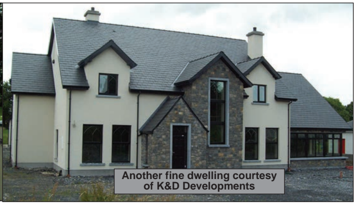
Another fine dwelling courtesy of K&D Developments

stress out of construction projects for our customers” Liam explains.