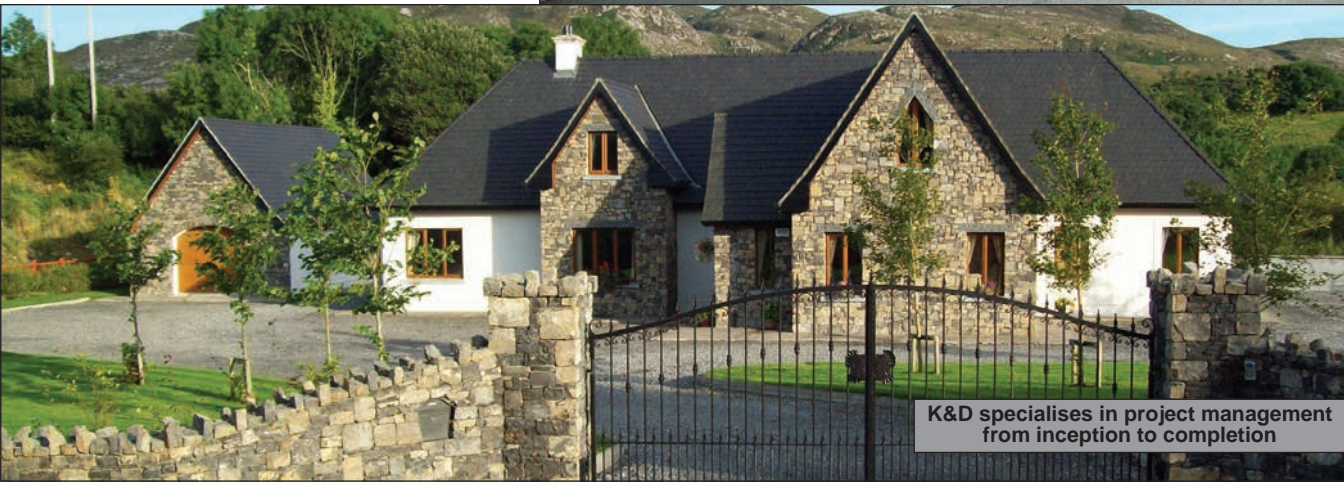
K&D specialises in project management from inception to completion