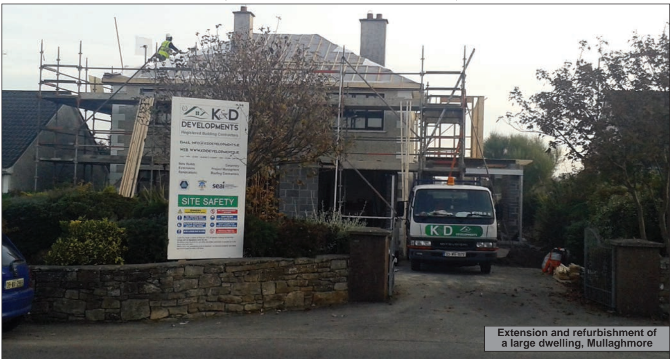
Extension and refurbishment of a large dwelling, Mullaghmore

The employees of K&D Developments operate to the highest standards and strive at all times to be consummate professionals who consistently and successfully deliver on time and within budget. They achieve this by employing their vast experience and expert knowledge of the construction industry, implementing a broad range of policies and procedures, ensuring they comply with building